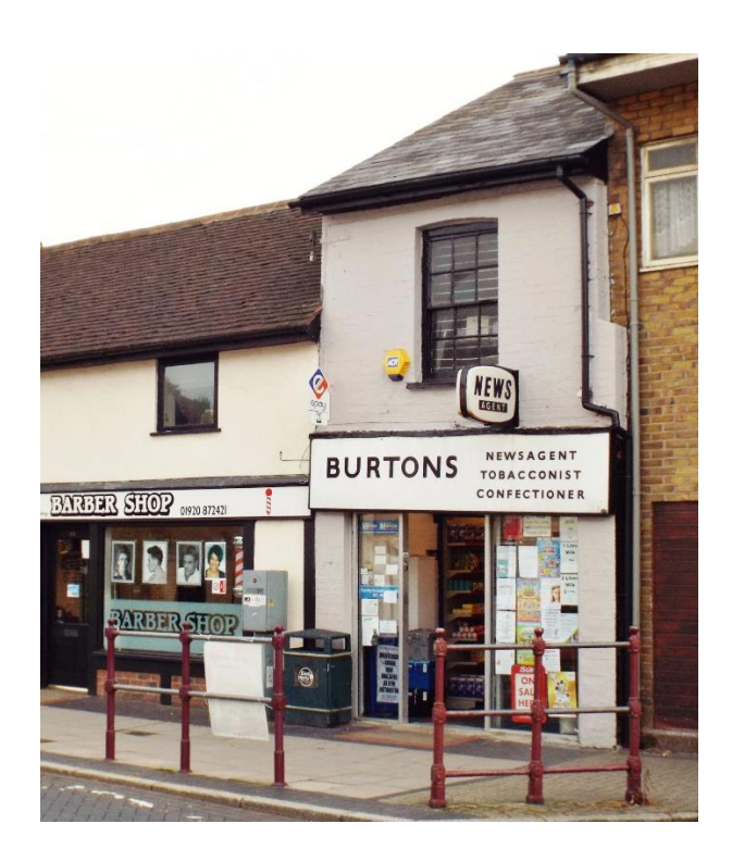
By comparison this colour view dates from 2013 and shows how remarkably little change had occurred to the shop frontage over a forty year period.