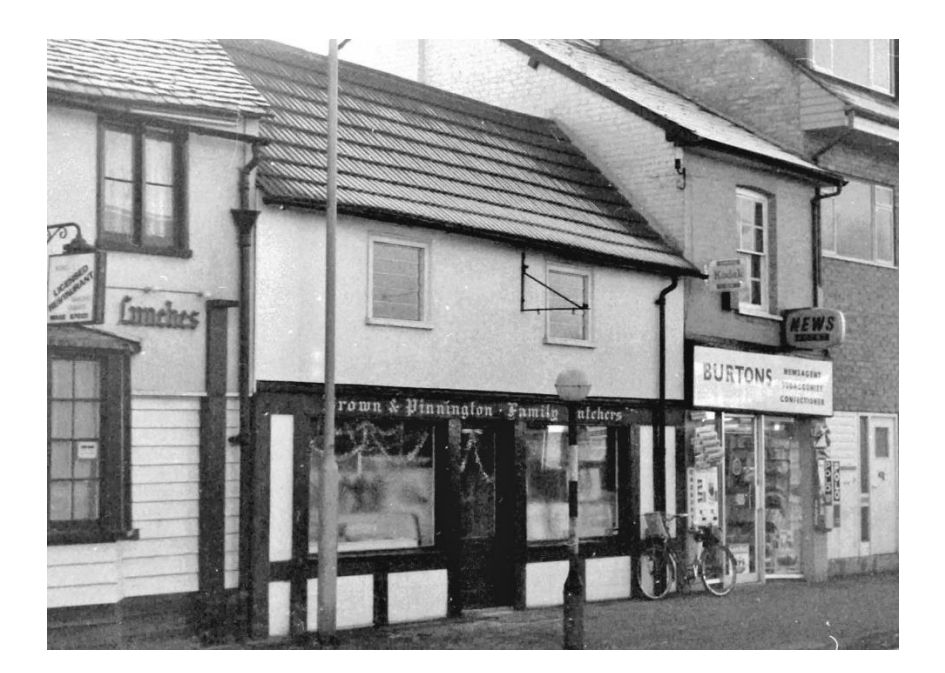
A 1973 picture of Burtons shop showing the newspapers in racks and a selection of vending machines including the green and white of the Polo mint machine on the far side of the shopfront.